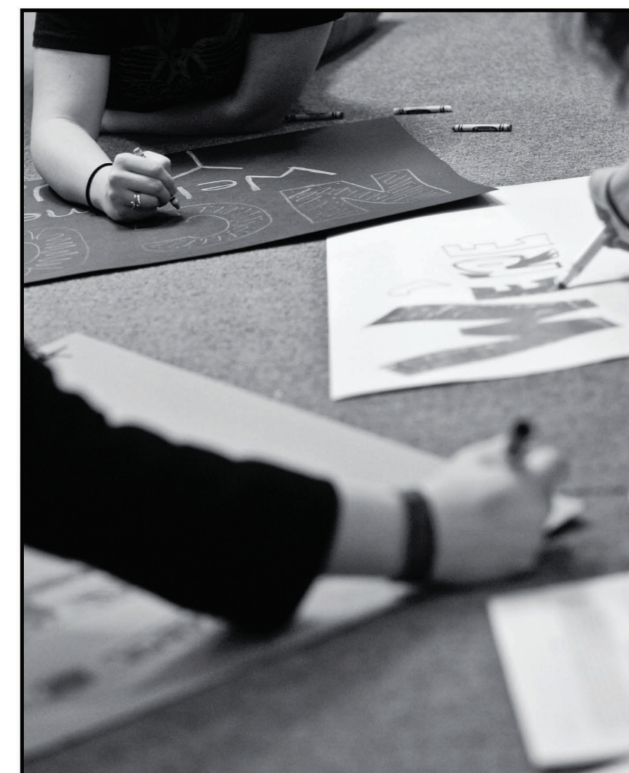
Right: Late night, Feb. 21, 2008, prior to picking up the never-before-seen or spoken-to refugee family from O'Hare, students from the Uncommon Life Movement gather in Koten Chapel to create welcome signs.